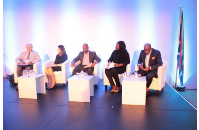
Transforming the built environment through empowering SMMEs