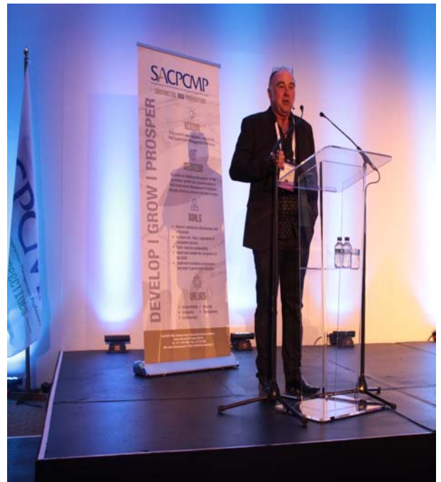
The scene was set regarding the harsh realities of the health and safety within infrastructure development