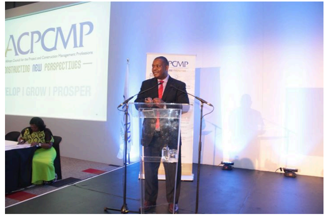
It is easy to put up concepts but it is another thing on what they mean says MEC of Infrastructure Development Jacob Mamabolo