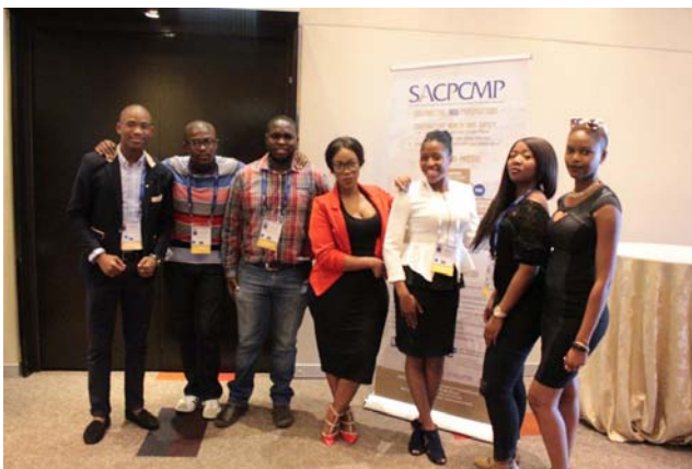
Students also attended the conference-transforming the industry by integrating the youth #SACPCMP

The poor image of the industry is barrier to entry. Things like innovation, proper communication and health and safety needs to be improved in order to attract the youths says Tjiamogale Eric Manchidi #SACPCMP16