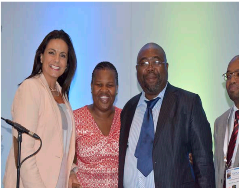
Closed on a high note with the Minister of DPW pledging his support for the Presidential Forum and resolutions of the Conference