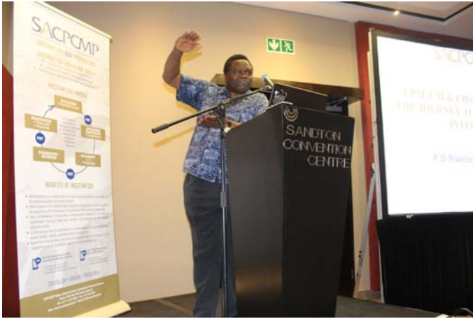
The first (1 st ) Structured Candidate Programme Workshop that will be rolled out Provincially